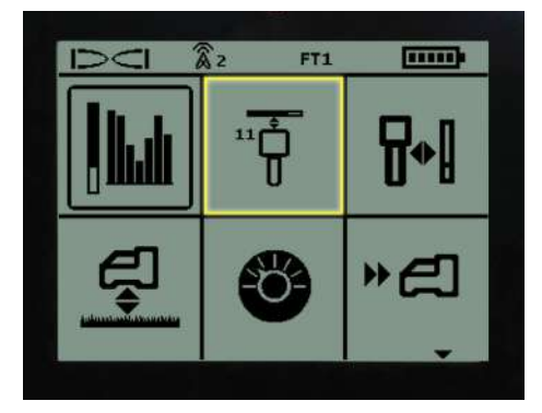
Two clicks to scan, and pair, with new Quick Scan Pair (QSP) feature.

limited to using only one frequency at a time while drilling. Sidestep active interference with new V2 Dual-Power capability and give yourself an edge with lithium-ion transmitter batteries.